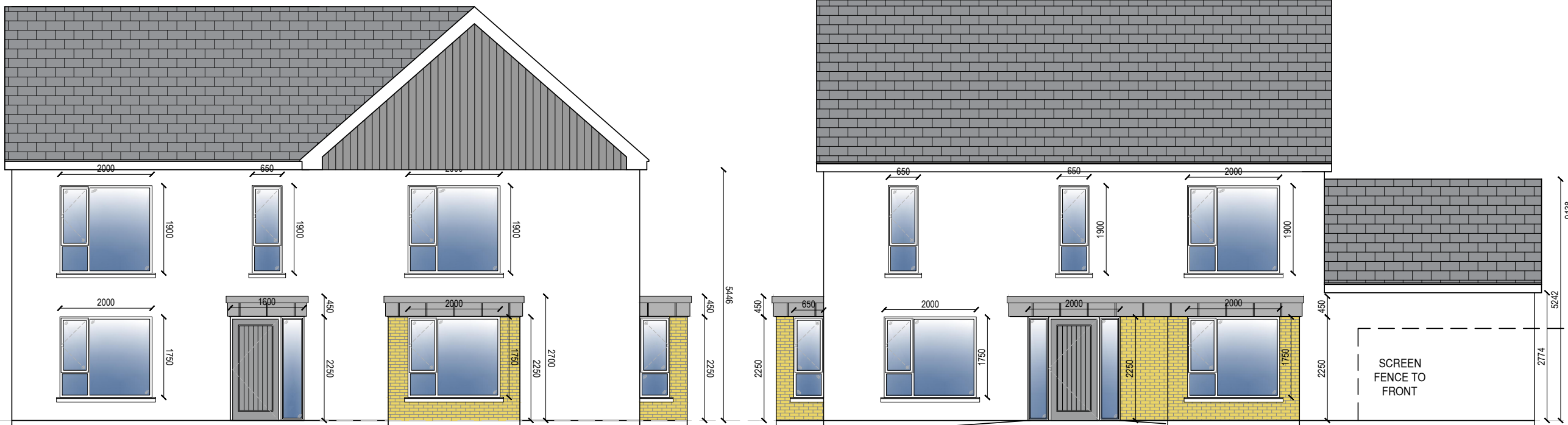
LEFT HAND SIDE 'FRONT' ELEVATION