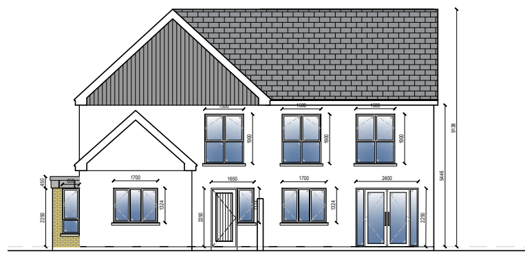
SIDE ELEVATION (TO PRIVATE GARDEN)