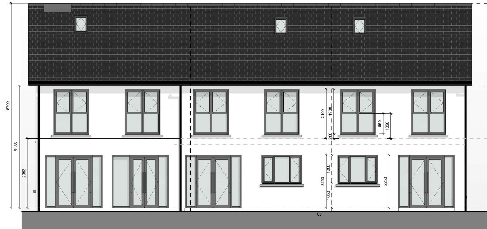
BACK ELEVATION TYPE D(m) 1: 50 @ A1 1:100 @ A3