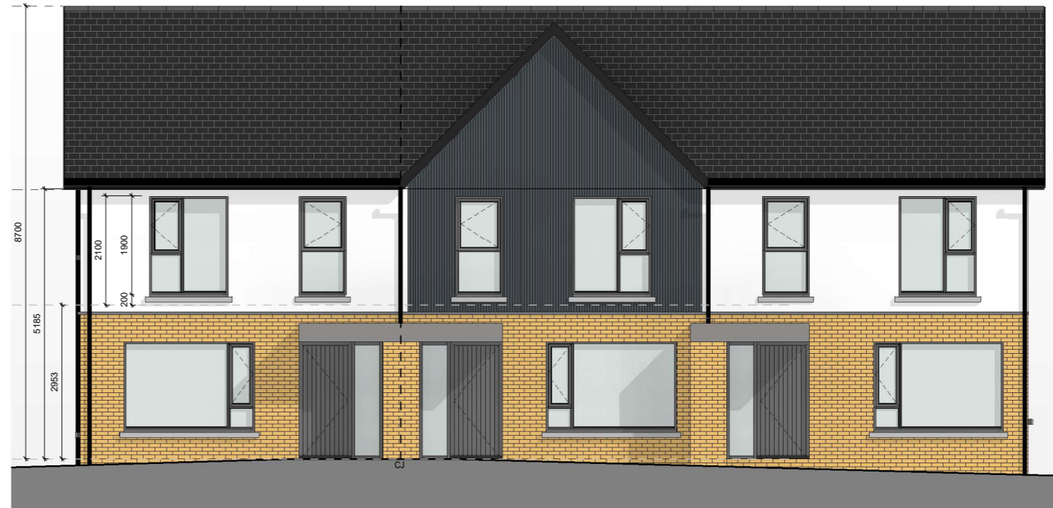
FRONT ELEVATION TYPE D 1: 50 @ A1 1:100 @ A3