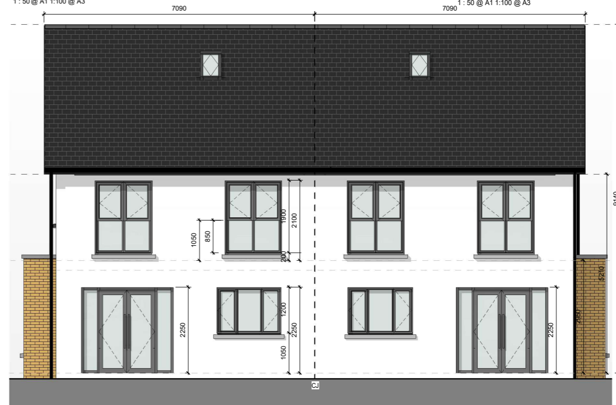
REAR ELEVATION TYPE E1 1: 50 @ A1 1:100 @ A3