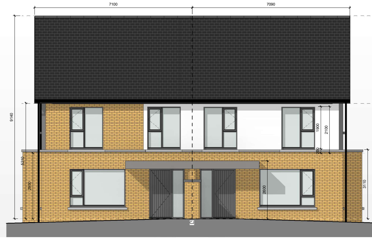
FRONT ELEVATION TYPE E2 1: 50 @ A1 1:100 @ A3