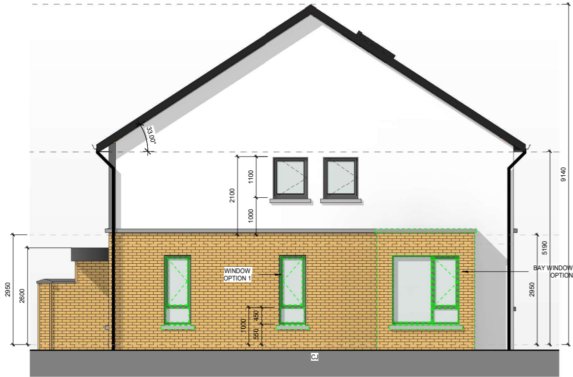
SIDE ELEVATION TYPE E2 1: 50 @ A1 1:100 @ A3