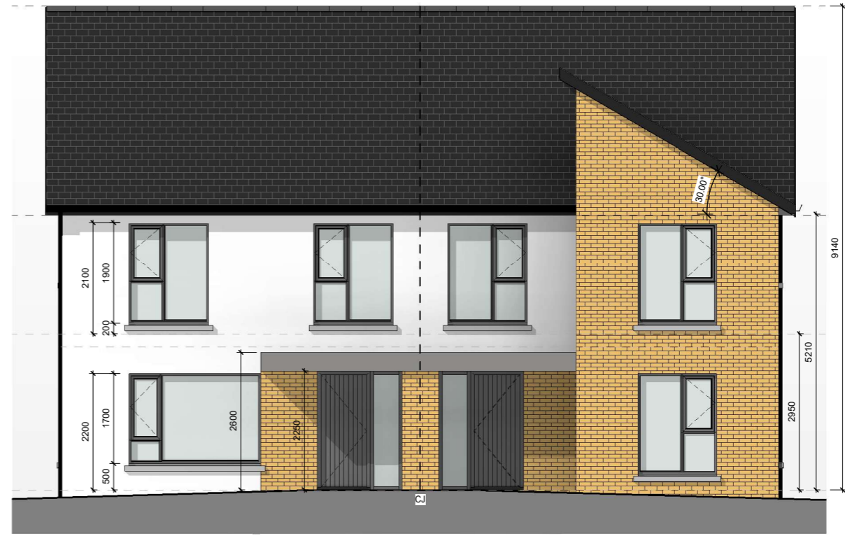
FRONT ELEVATION TYPE F2 1: 50 @ A1 1:100 @ A3