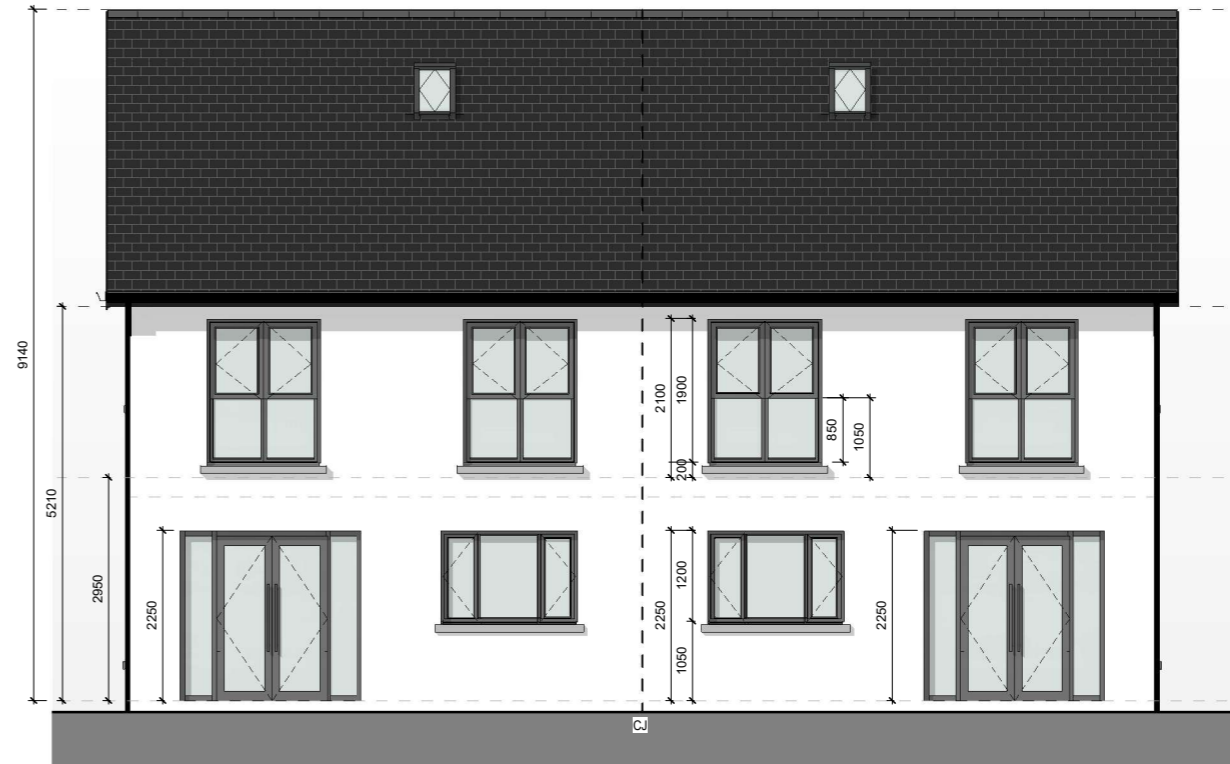
BACK ELEVATION TYPE F1 1: 50 @ A1 1:100 @ A3