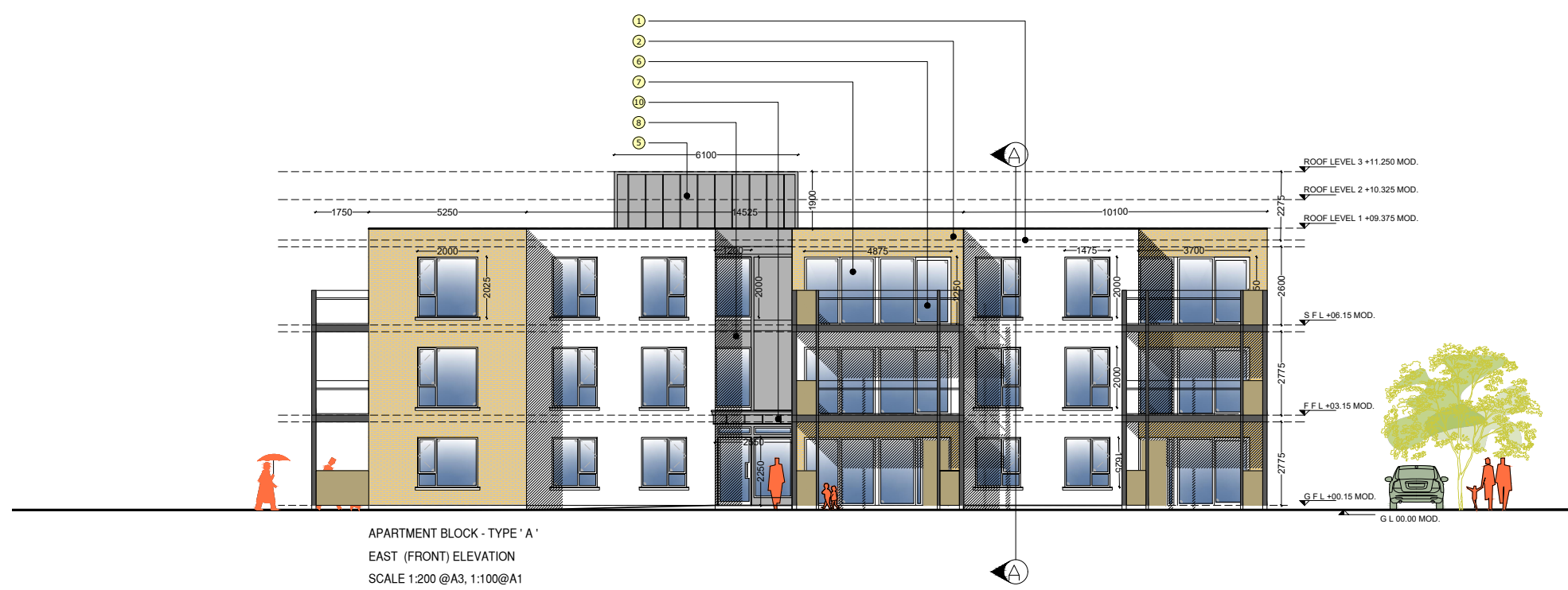
APARTMENT BLOCK - TYPE 'A' EAST (FRONT) ELEVATION SCALE 1:200 @A3, 1:100@A1