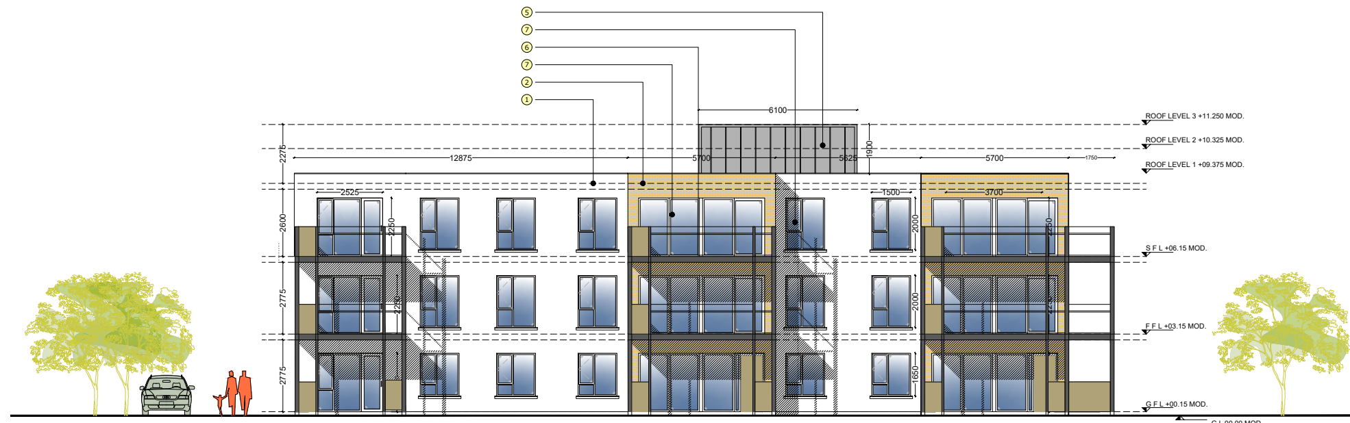
APARTMENT BLOCK - TYPE 'A' WEST (REAR) ELEVATION SCALE 1:200 @A3, 1:100@A1