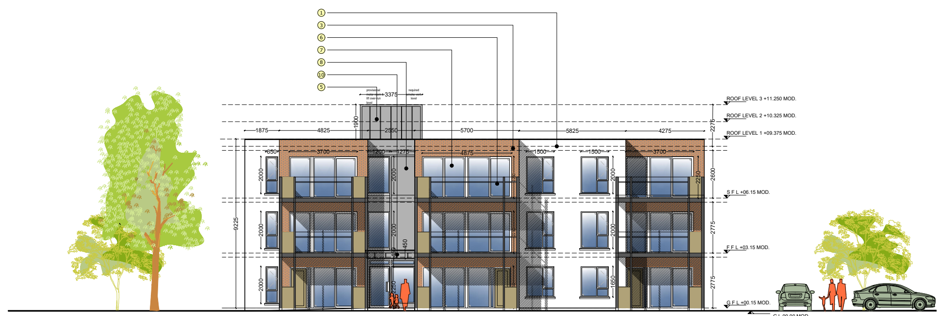
APARTMENT BLOCK - TYPE 'B' WEST (FRONT) ELEVATION SCALE 1:200 @A3, 1:100@A1