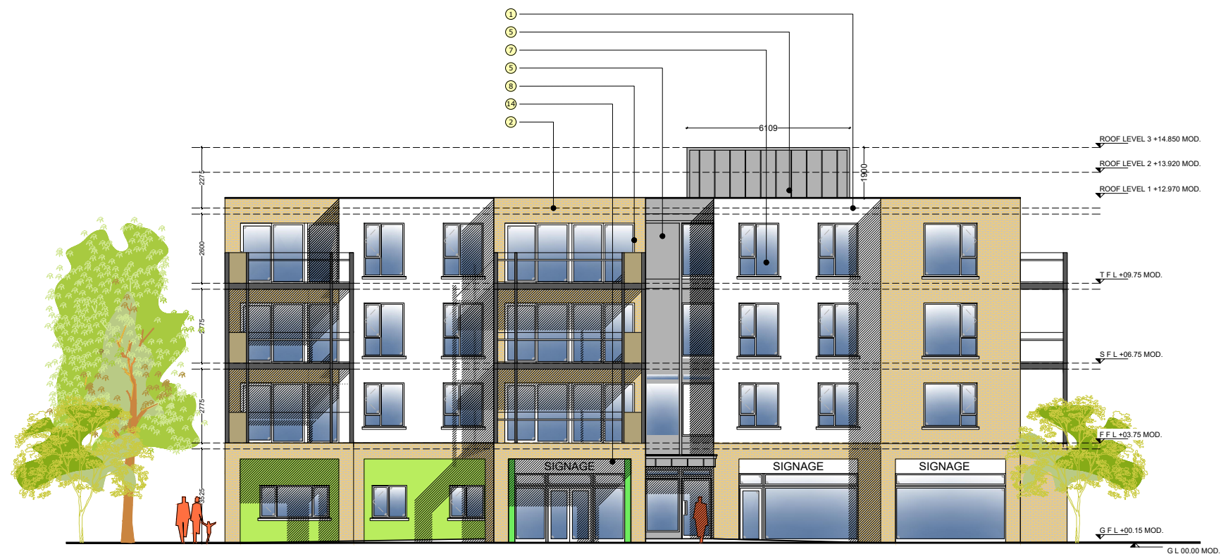
APARTMENT BLOCK - 'NEIGHBOURHOOD CENTRE' WEST ELEVATION SCALE 1:200 @A3, 1:100@A1