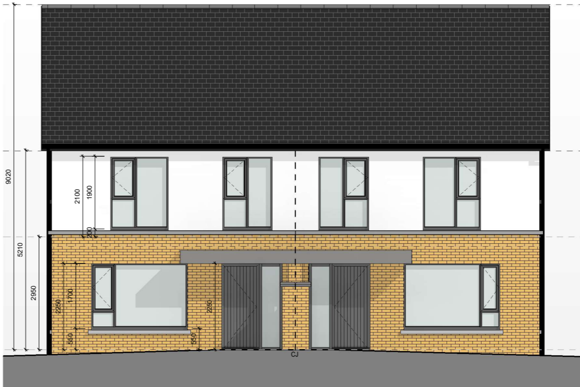
FRONT ELEVATION TYPE A(m) 1: 50 @ A1 1:100 @ A3 FRONT ELEVATION TYPE A 1: 50 @ A1 1:100 @ A3