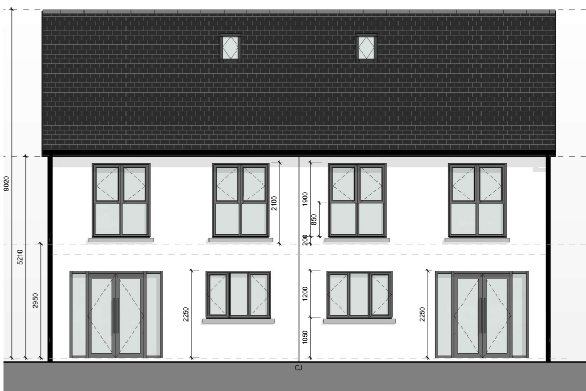
BACK ELEVATION TYPE A 1: 50 @ A1 1:100 @ A3 BACK ELEVATION TYPE A(m) 1: 50 @ A1 1:100 @ A3

DRAWN BY BRIAN O'NEILL, GITTENS MURRAY ARCHITECTS LTD