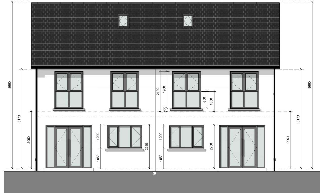
BACK ELEVATION B 1: 50 @ A1 1:100 @ A3