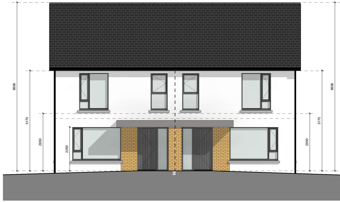
FRONT ELEVATION Type B(m) 1: 50 @ A1 1:100 @ A3